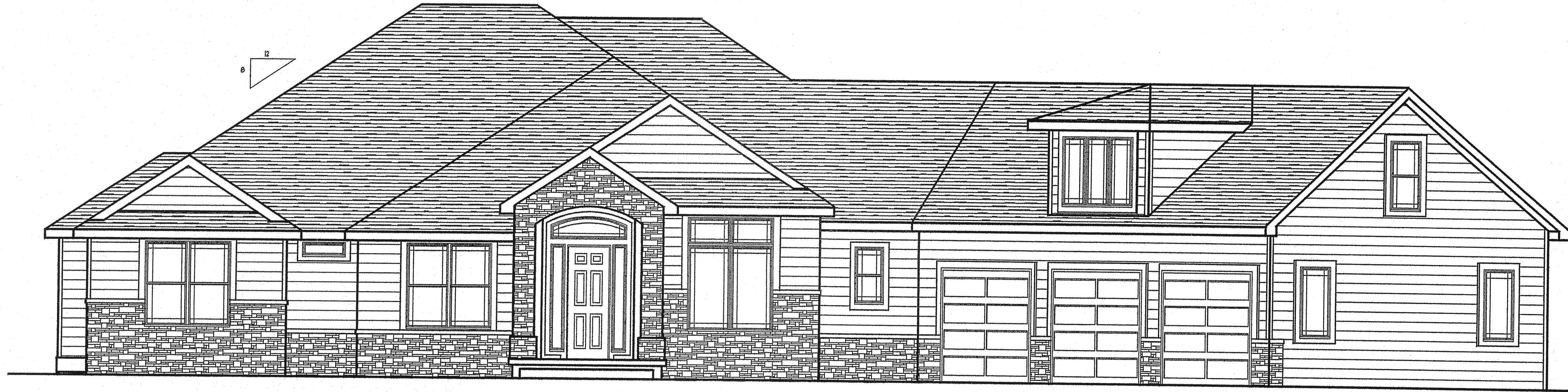
FRONT ELEVATION B

OREGON WASHINGTON IDAHO O.W.I. HOMES INC. 6855 W. CLEARWATER AVE. SUITE N KENNEWICK, WASHINGTON 99336 PHONE: (509) 737-8192 FAX: (509) 737-8503